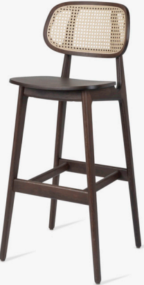
TITUS TOBACCO STAINED BEECH BAR STOOL