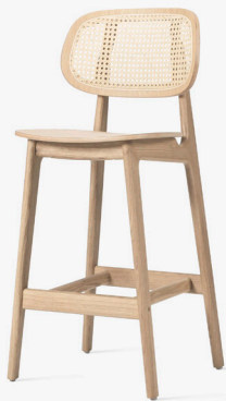
TITUS NATURAL OAK COUNTER STOOL