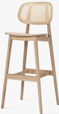
TITUS NATURAL OAK BAR STOOL