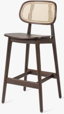
TITUS TOBACCO STAINED BEECH COUNTER STOOL