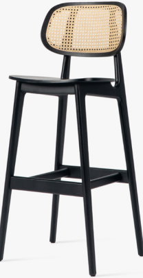
TITUS BLACK STAINED OAK BAR STOOL