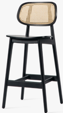
TITUS BLACK STAINED OAK COUNTER STOOL