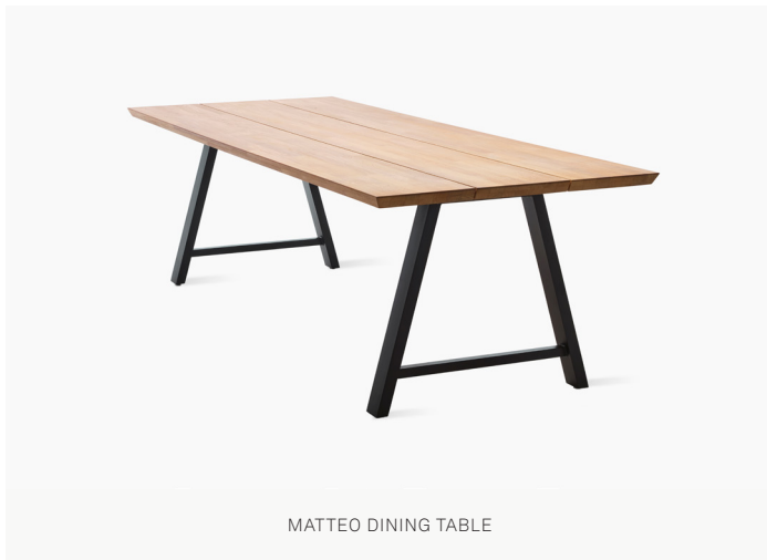
MATTEO DINING TABLE