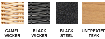
CAMEL WICKER BLACK WICKER BLACK STEEL UNTREATED TEAK