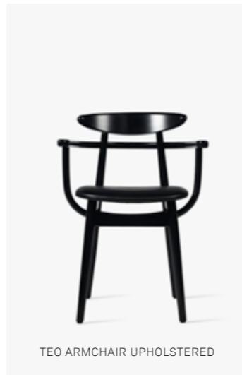
TEO ARMCHAIR UPHOLSTERED