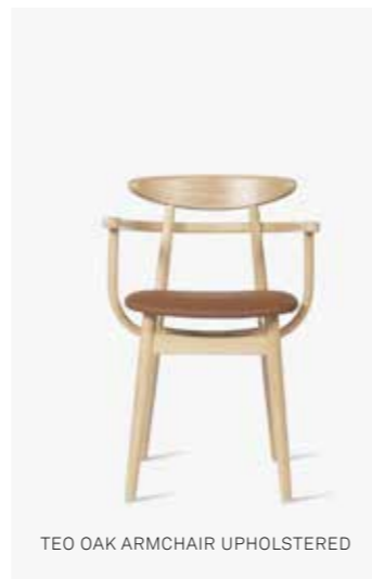
TEO OAK ARMCHAIR UPHOLSTERED