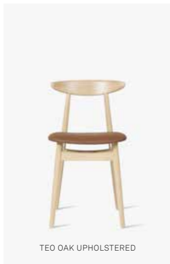
TEO OAK UPHOLSTERED