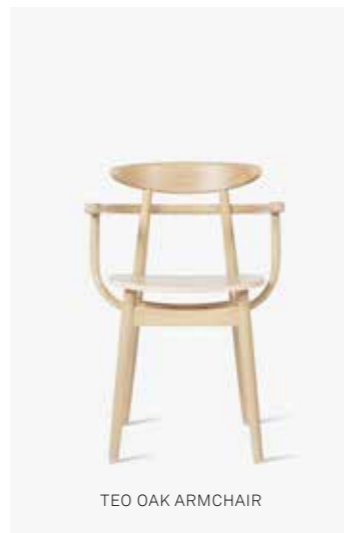
TEO OAK ARMCHAIR